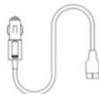
12V-14V car charger cable